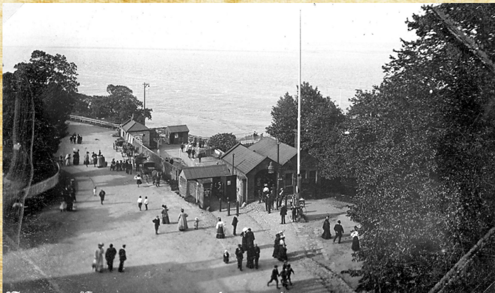
Above - Early season activity at Eastham Ferry as the crowds start to arrive to enjoy the Gardens Below - Fred Brooks Vaudeville Troupe perform on the stage at Eastham Gardens